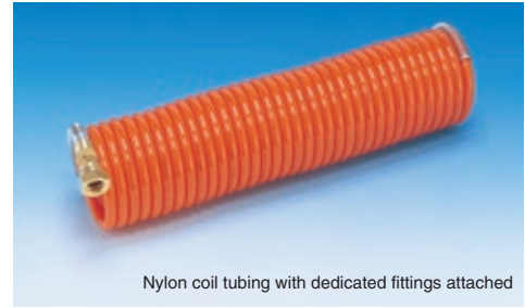
Nylon coil tubing with dedicated fittings attached